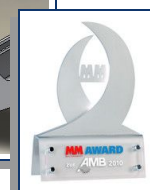
Awarded with MM Award at AMB 2010